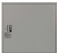
GALVANIZED STEEL SHEET

Facade paint painted. Solution resistant to atmospheric condition and UV radiation