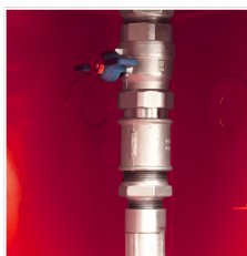
BALL VALVE 32 - OPTIONAL

Hydrant can be connected to DN52 water supply due to 52 valve with slant reduction