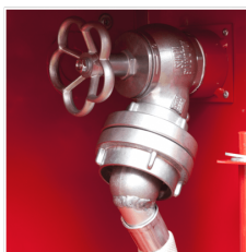
52 VALVE WITH SLANT REDUCTION

Hydrant can be connected to DN52 water supply due to 52 valve with slant reduction