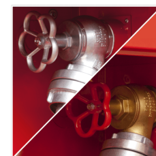
52 HYDRANT VALVE