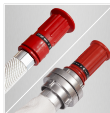
NOZZLE CONNECTION WITH HOSE