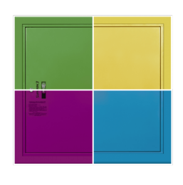
INDIVIDUAL COLOR Any color from RAL pallet