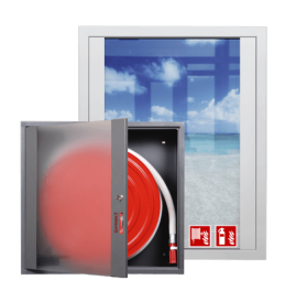
SAFETY GLASS Door with matt or transparent glass. Any graphic