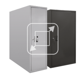
NON-STANDARD DIMENSIONS Possible to adopt dimensions to customer request

PPUH SUPRON 3 Sp. z o.o. Poland 26-600 Radom, Sadownicza 6